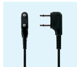
Double mono jack